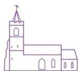
St John the Baptist Great Amwell