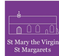
St Mary the Virgin St Margarets