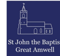
St John the Baptist Great Amwell